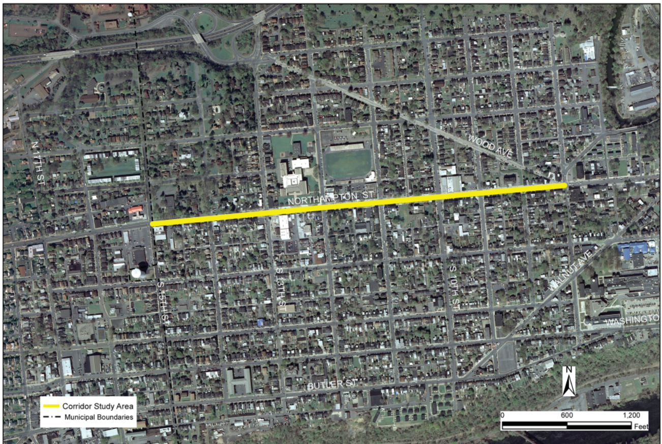
Northampton Street (S.R. 248) Corridor 15 th Street to 7 th Street